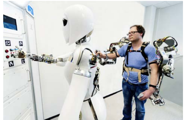
Teleoperation scenario: Remote control of the robot AILA

Application: Space robotics, Teleoperation