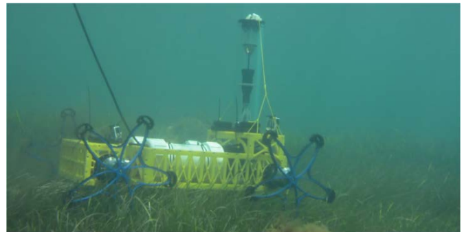
Underwater test drive on seaweed field (June, 2015)

YEMO is an underwater micro rover that features extraordinary mobility and agility at the seafloor. It was engineered based on the already successfully deployed ASGUARD robot of DFKI. This allows the employment of the robot in difficult environments, both ashore and under water – without having the need to perform additional modifications. The installed power supply facilitates remotely controlled and semi autonomous applications; when using the robot under water, the communication with the user is established using a buoy. Beyond that, a camera with a 360-degrees-field of view enables quick exploration and mapping of the seafloor and offers a solid sensor base for autonomous execution of tasks.