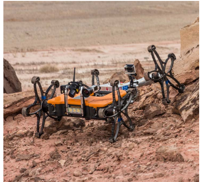
Coyote III with fully integrated rover system-bus

Application: Space Robotics, Search and Rescue (SAR)