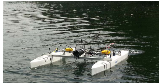
The ASV on the Stadtwaldsee

In the future the ASV should operate as an support vehicle during missions of the AUV - Avalon and be the mediator between Avalon and the human control team. During this, the ASV tracks the motion of Avalon using the installed camera and follows the AUV. Using a underwater modem, which is installed in both of the vehicle, a direct communication between them can be ensured. This communication make it possible, that the AUV – Avalon can use the depth map, created by the ASV, for localization and navigate safety in unknown underwater environments.