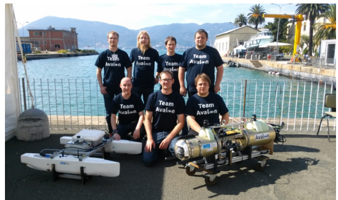
The Avalon team during a contest with the ASV and AUV