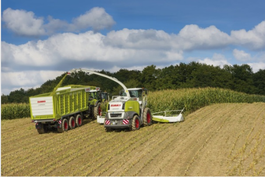
Proactive planning for silage maize harvesting

Methods and technologies to provide proactive planning and controlling of cooperative agriculture processes, exemplified by silage maize harvesting