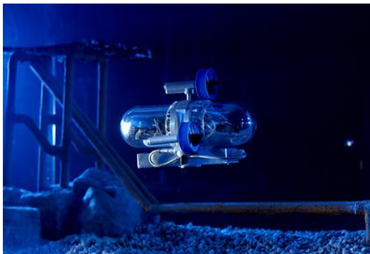
The μAUV 2 during inspection