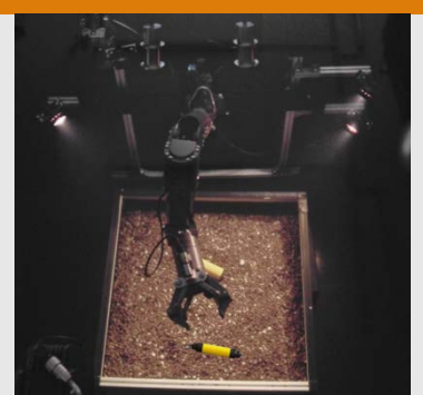
Transponder collection scenario