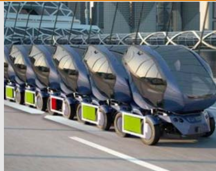
Energy sharing in a road train