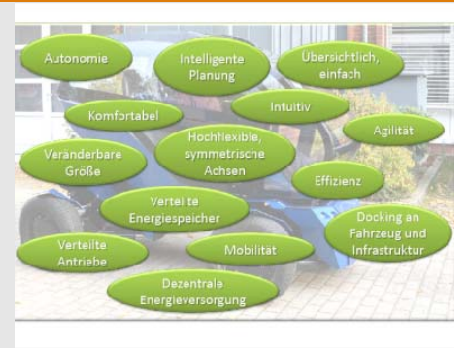
Design aspects of new concept car