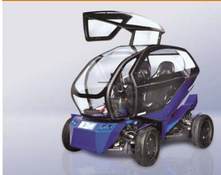
EO smart connecting car prototype