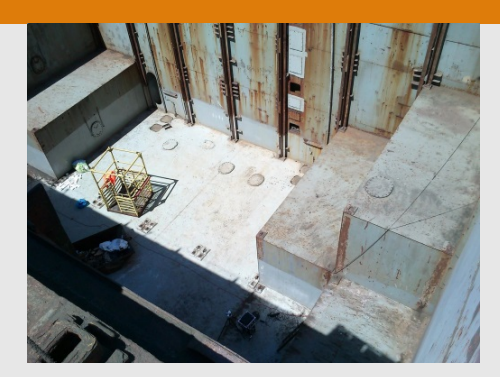
The Crawler is able to inspect even hard-to-reach regions like cargo holds.