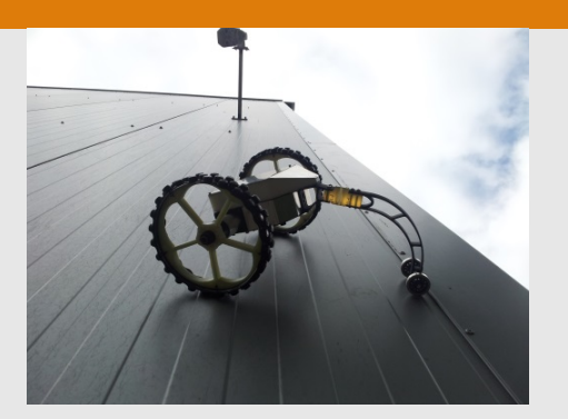
An ultra-light magnetic crawler for the inspection of cargo holds and ship hulls.