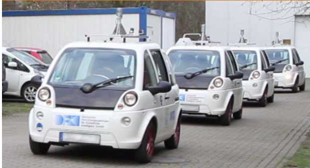
Concept: Vehicles drive autonomously in a convoy with virtual drawbar

Cooperation of the Model Regions Bremen/Oldenburg and Dalian